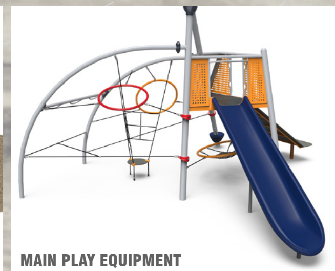
MAIN PLAY EQUIPMENT